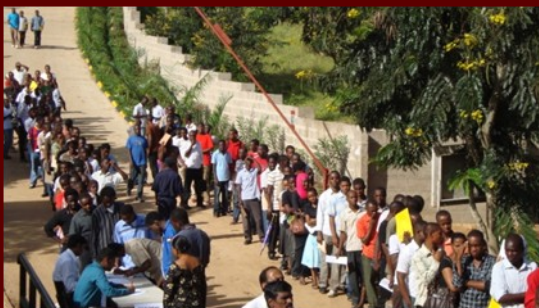
STUDENTS ENTRANCE EXAM